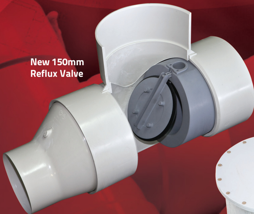
New 150mm Reflux Valve